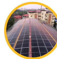
Metal Shed Projects