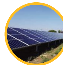
Ground Mount Installation