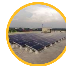
RCC Rooftop projects